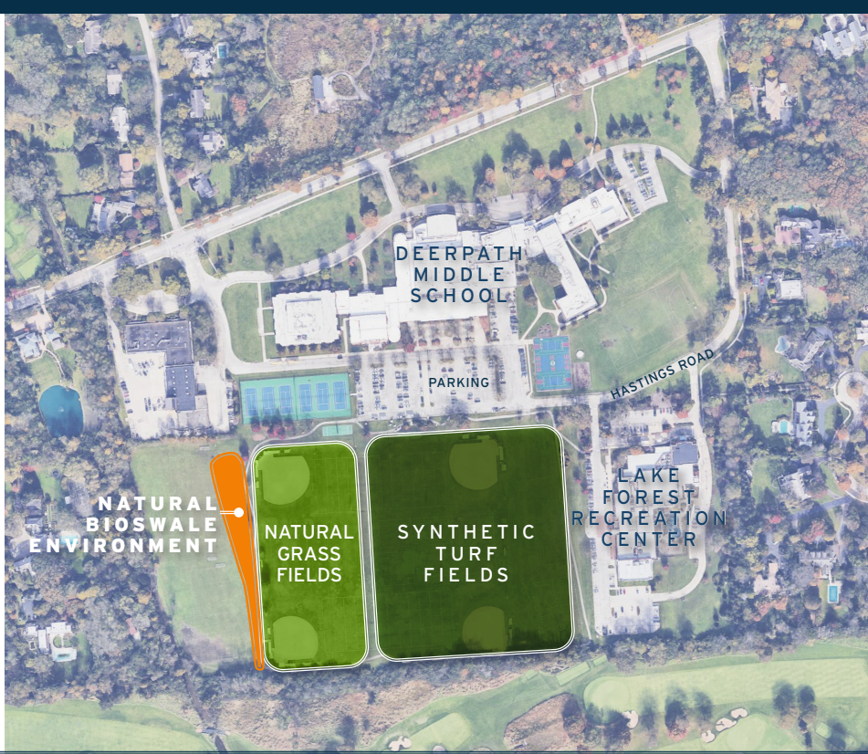
From the workshop presentation.