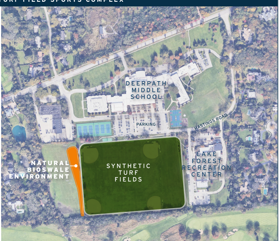
From the workshop presentation.